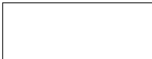
AirSep "AS-K" Oxygen Generator Feed Air Requirement (93% nominal oxygen)

Commercial Products Division 260 Creekside Drive Buffalo, NY 14228-2075 U.S.A. Tel: (716) 691-0202 Fax: (716) 691-1255 URL: http://www.airsepcpd.com E-mail: cpd@airsep.com